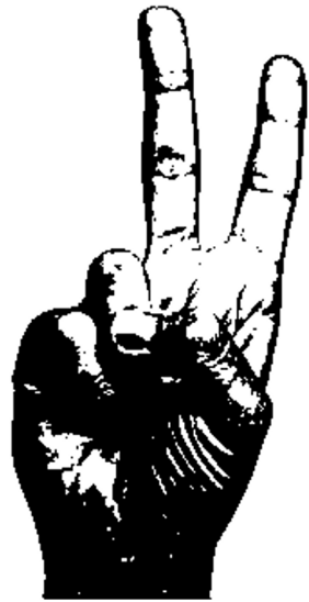
Needs more discussion